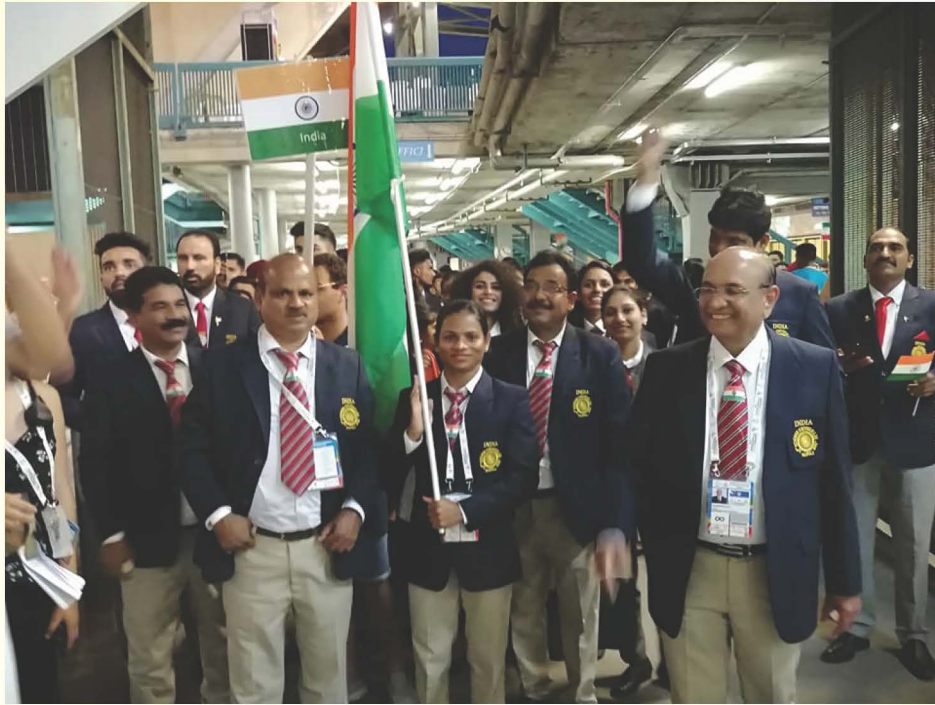
World University Games - Napoli, Italy - 2019