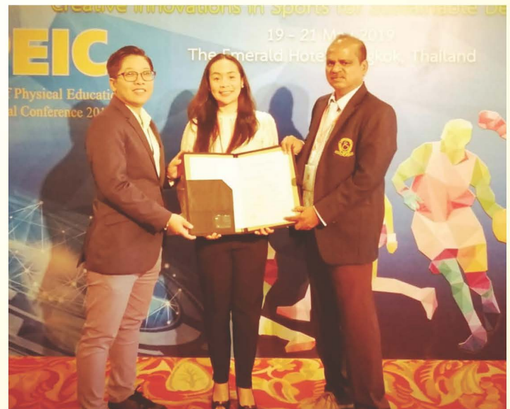
Dr. Ajay Singh Thakur Best Paper Award