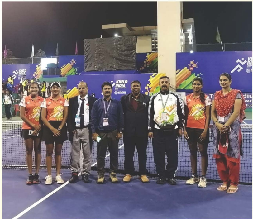
Khelo India University Games - Bhubaneswar - 2020