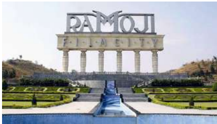
RAMOJI FLIM CITY