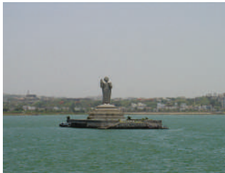
BUDDHA STATUE, HYDERABAD