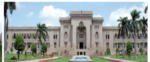
OSMANIA UNIVERSITY ARTS COLLEGE